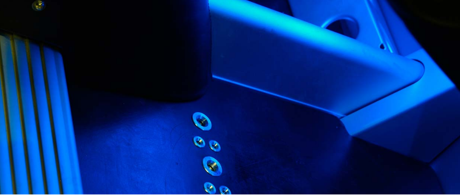
Lotus Elise interior structure