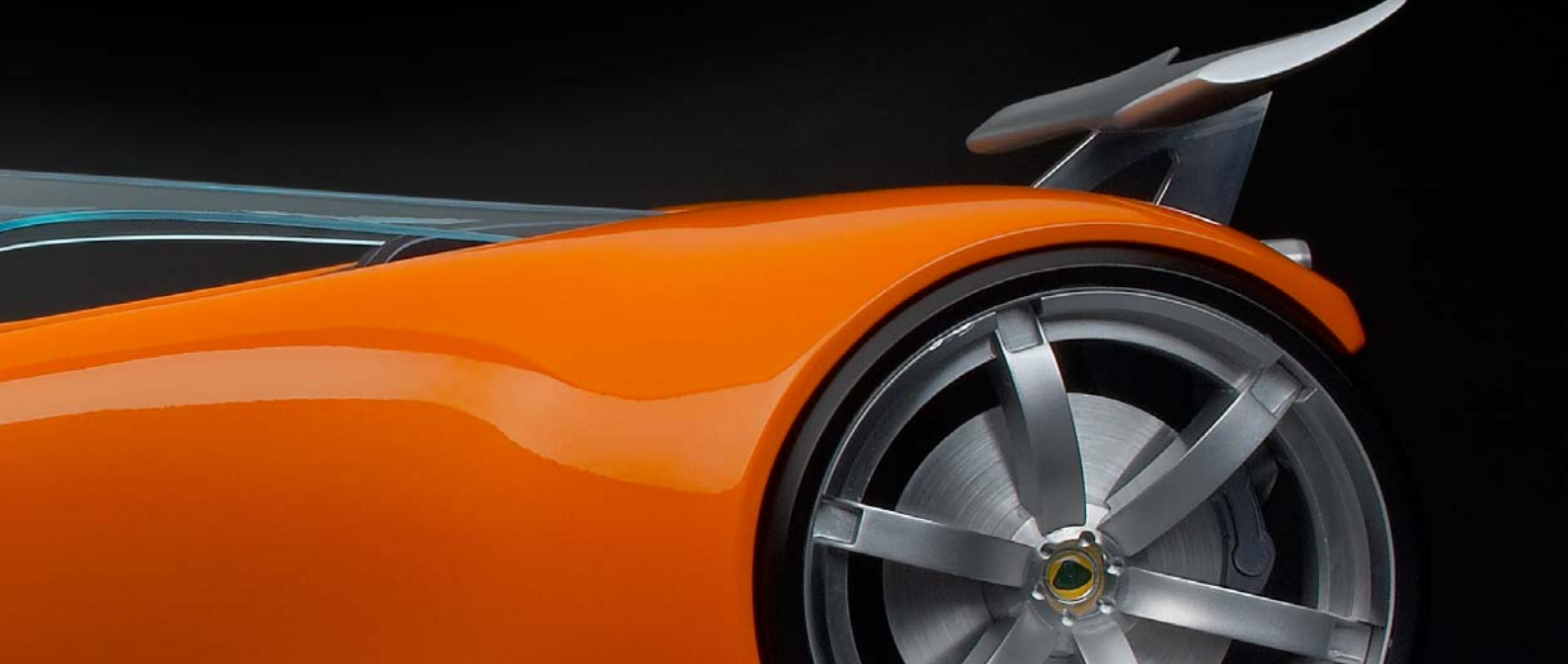
Lotus Hotwheels concept