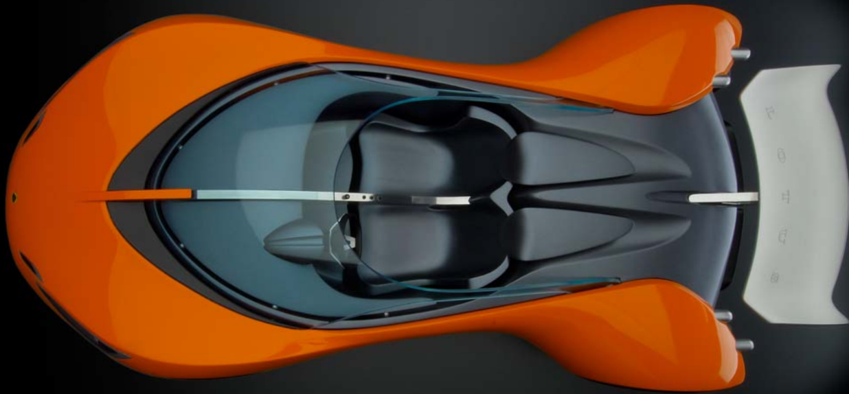
Lotus Hotwheels concept