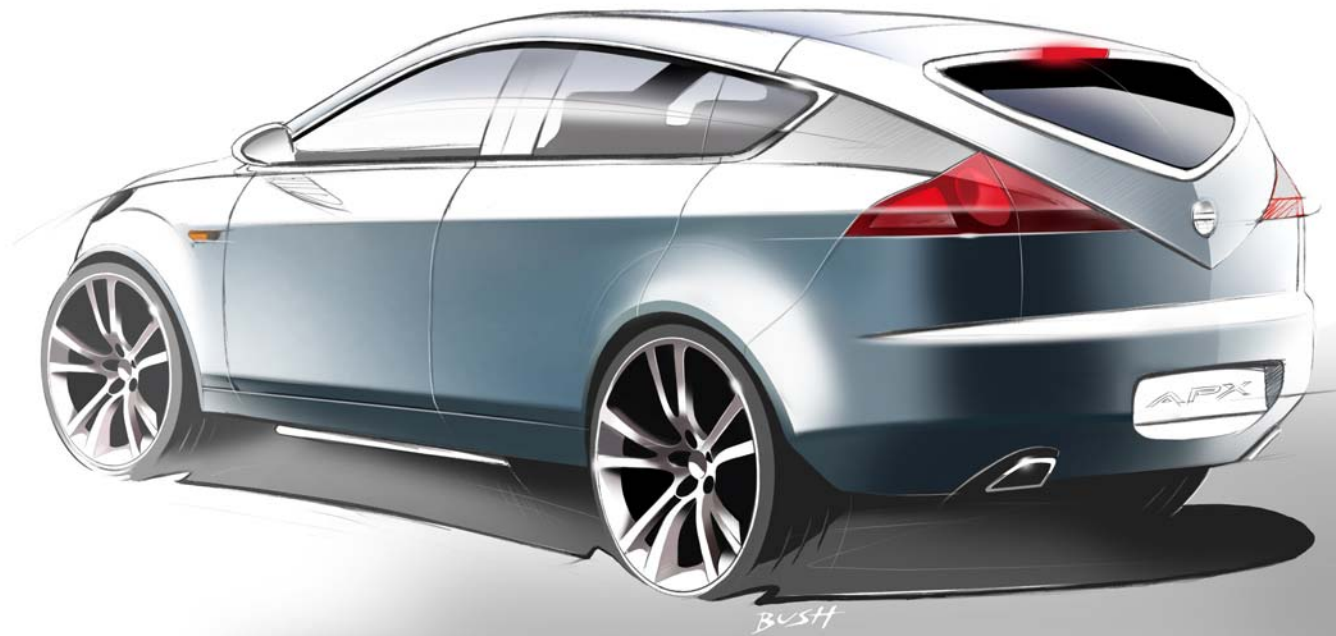
Lotus Aluminium Performance Cross-over (APX) concept