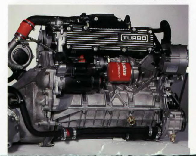
The powerhouse behind the performance – 2.2 litre, 16 valve DOHC turbo-charged engine.