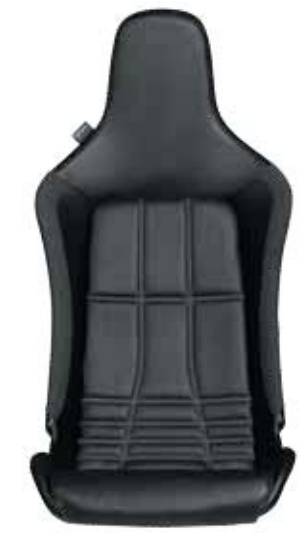
ProBax™ Seat ELISE/EXIGE

Choose from a range of seat options to create the perfect driving environment. You can also choose from a number of wheel options, each one designed to ensure that your Lotus grips the road as you enjoy its agility and race-bred performance capabilities.