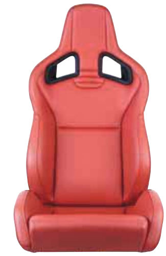
Recaro leather sports seat EVORA

Colour swatches are for illustration purposes only and may not accurately reflect the actual colour finish of the vehicle. Please consult your Lotus dealer for accurate colour samples.