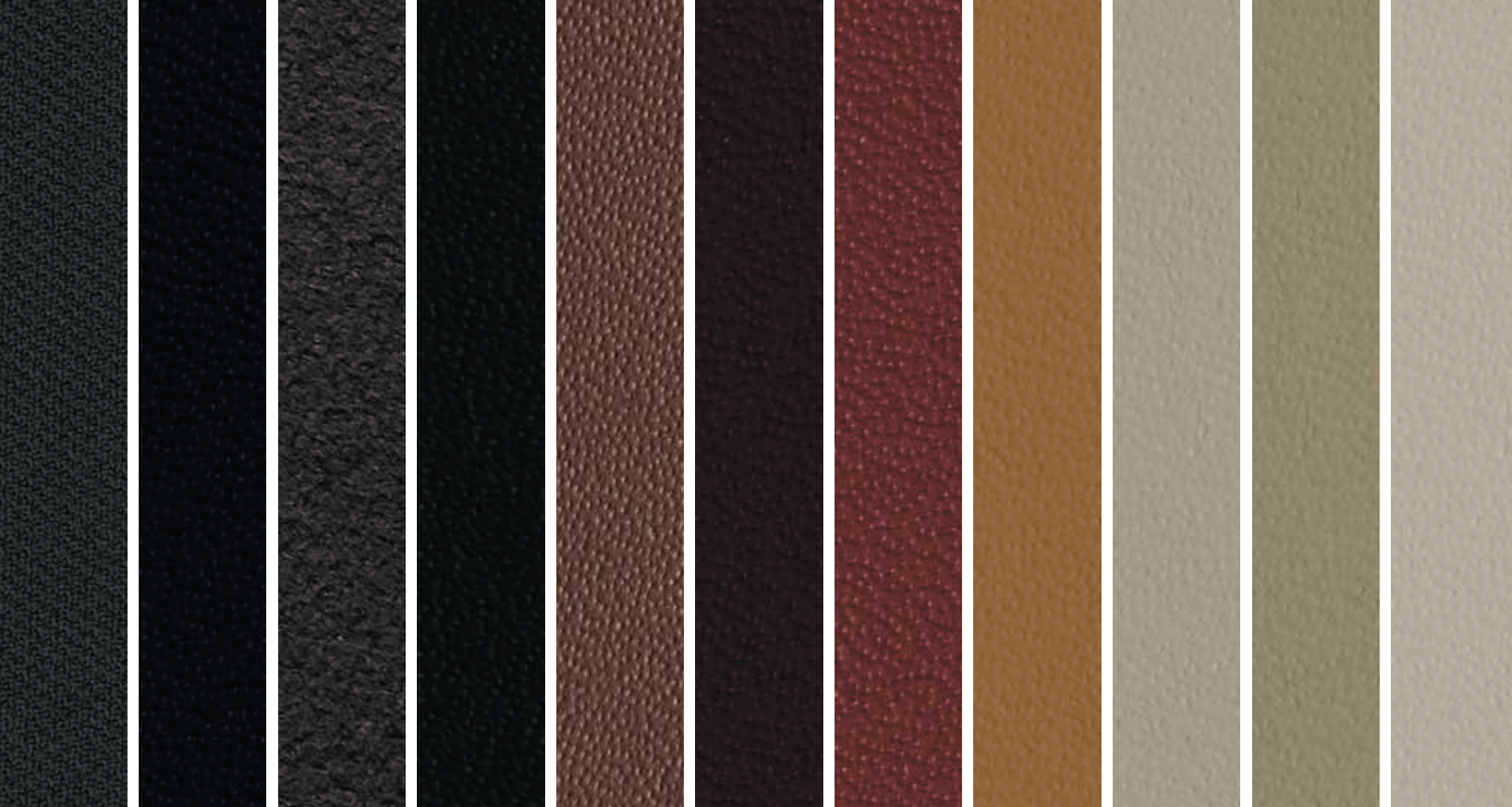
BLACK CLOTH BLACK LEATHER ANTHRACITE SUEDETEX® AVAILABLE JAN 2011 CHARCOAL LEATHER COCOBOLO LEATHER RUBY LEATHER PAPRIKA LEATHER BISCUIT LEATHER OYSTER LEATHER MAGNOLIA LEATHER CREAM LEATHER