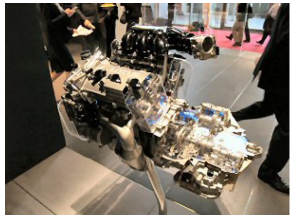
Evora V6 with IPS