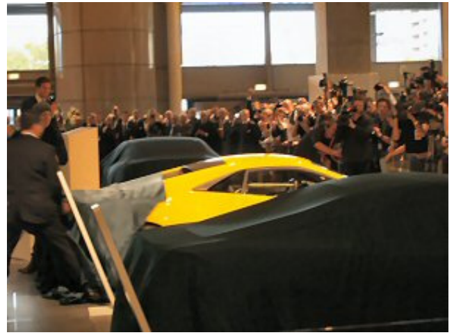
Mickey Rourke and ? with Elan