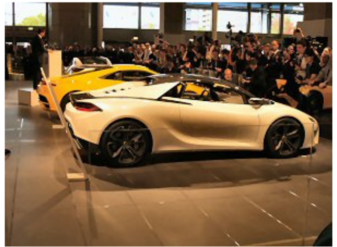
Elise and Elan