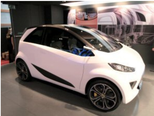
The Concept City Car