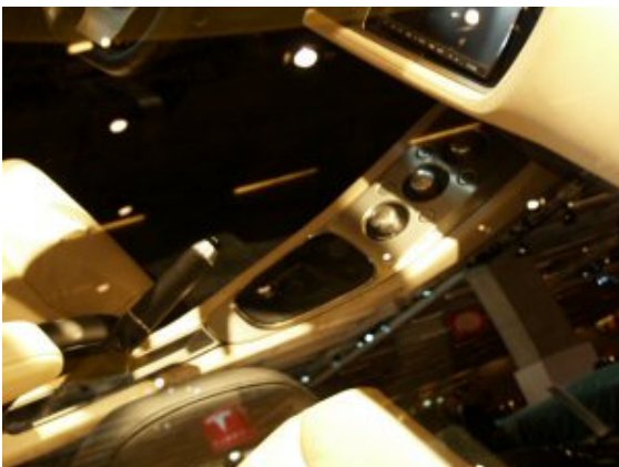
Evora IPS interior

Here are some images taken earlier today, 30-09-2010. Look at the crowd!