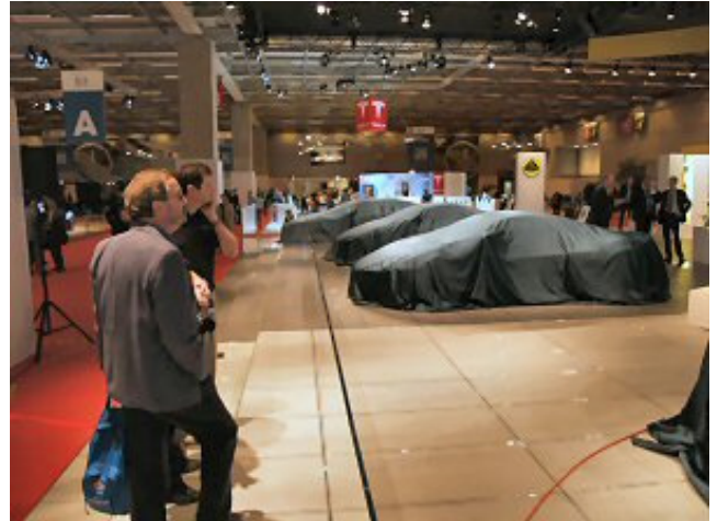
Impossible to select one this way....