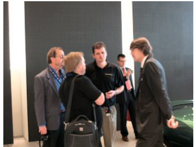
Talking with Lotus