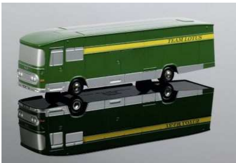
Team Transporter by Schuco