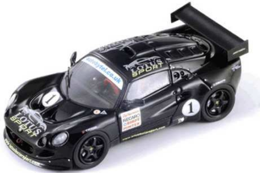
Sport Elise by Spark

And how about the new Sport Elise with central steering wheel?