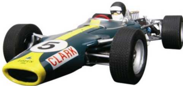
Lotus Type 49 by Scalextric

For 2008 Scalextric have announced a Type 49 and a Lotus Cortina (September), both being slotcars in 1/32rd scale.