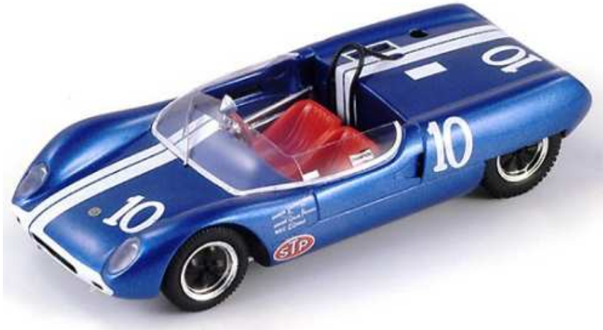
Lotus Type 23 by Spark

Spark continues to present new 1/43 rd models, we recently did see a new edition of the Type 23, C. Parsons Winner Laguna Seca 1963.