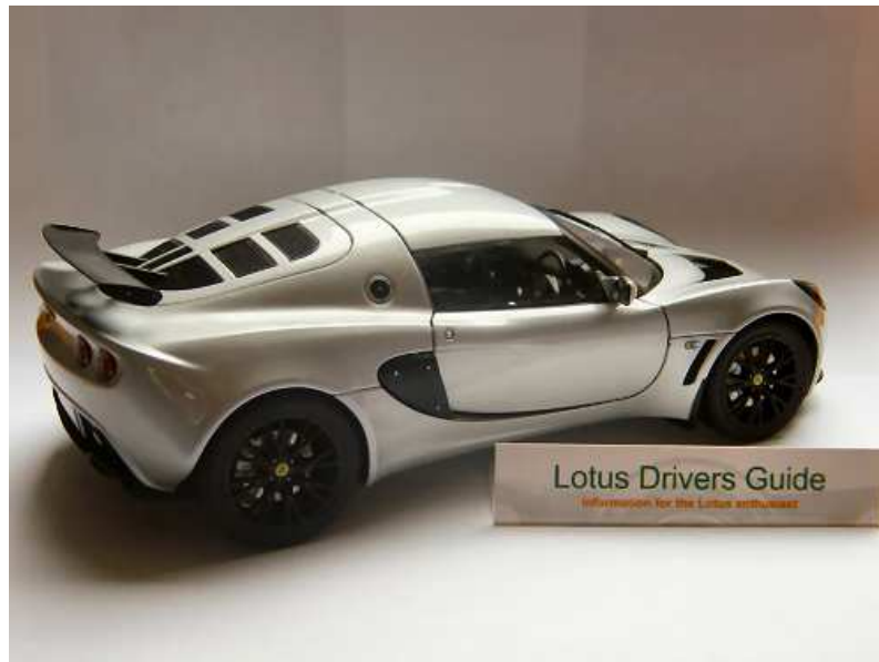
Exige 1/18 th by AutoArt