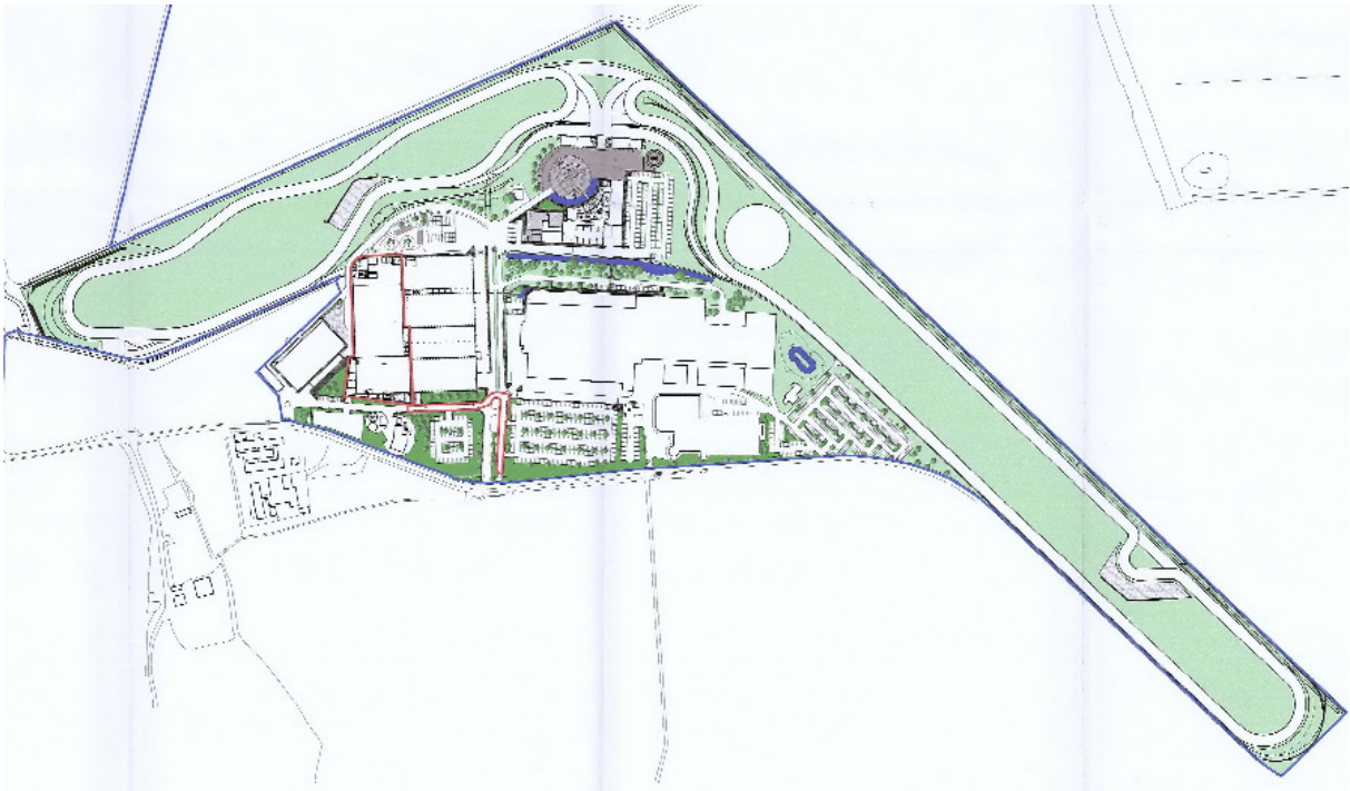
The new buildings are outlined in red