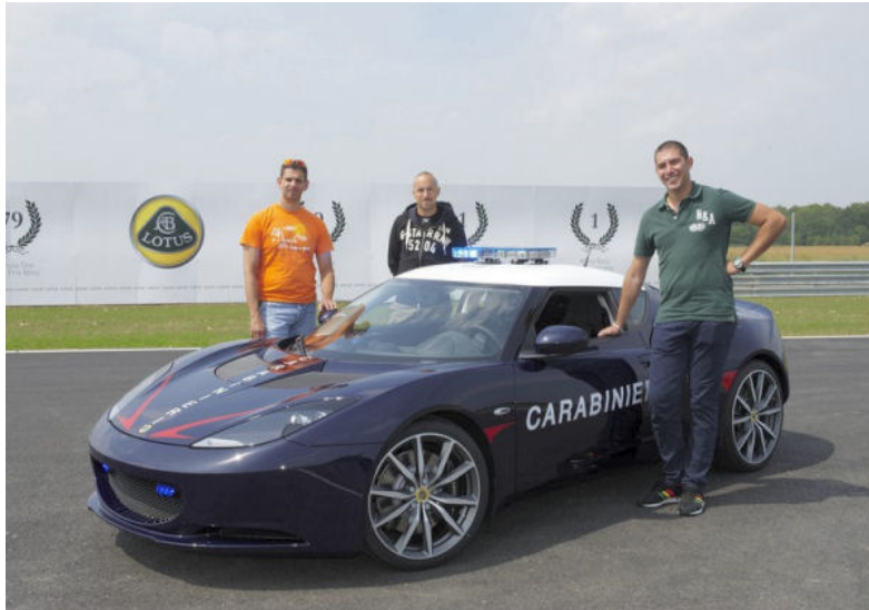
3 selected Carabinieri drivers have been educated at the Lotus Driving Academy