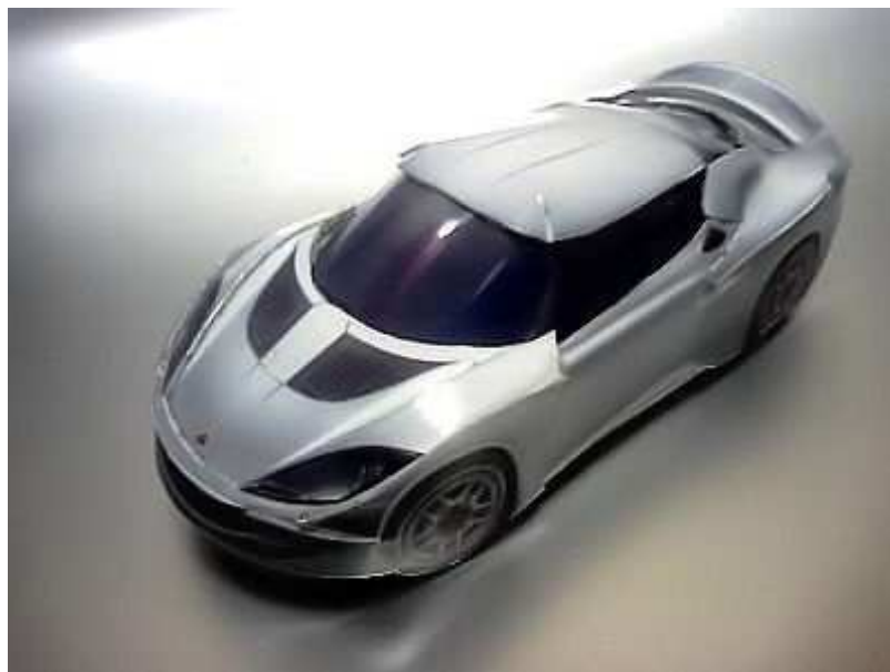
Create your own Evora