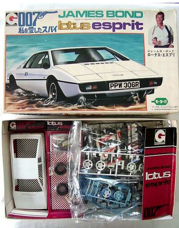
Edai Lotus Esprit 1/25

The kit includes an electrical engine that will run on two AA size batteries.