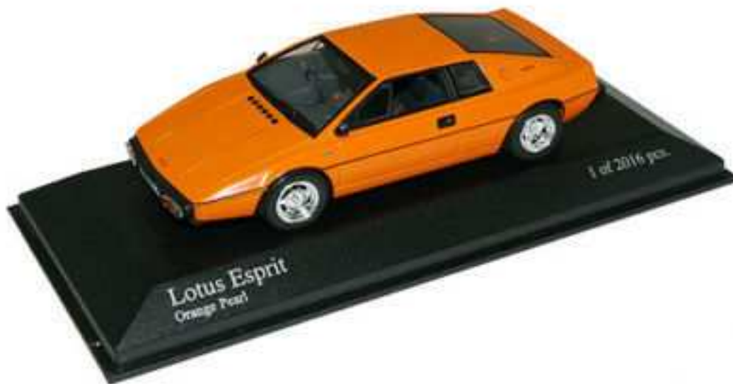
Minichamps Lotus Esprit 1/43

Minichamps have recently issued a model of the 1978 Esprit, in orange pearl colour with proper tartan plaid seats. It is a 'limited edition', 1/43 rd scale.