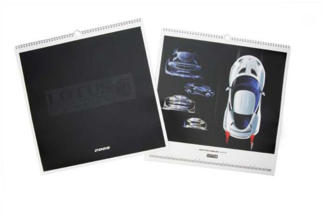
Lotus design 2009 calendar

The Lotus Design 2009 Calendar is available from the Group Lotus webstore