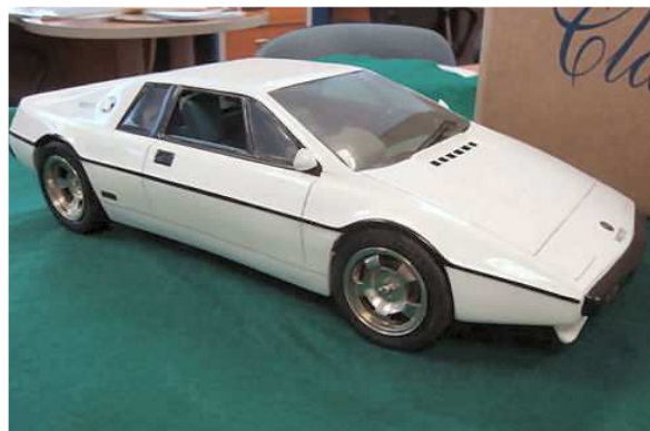
Esprit kit by Classic Models, 1/12

Miniwerks had a limited run of 10 Tameo Lotus 56B models made by Built Up Models (France). Very high quality and price.... Remember this is 1/43 rd scale! Here are two images: