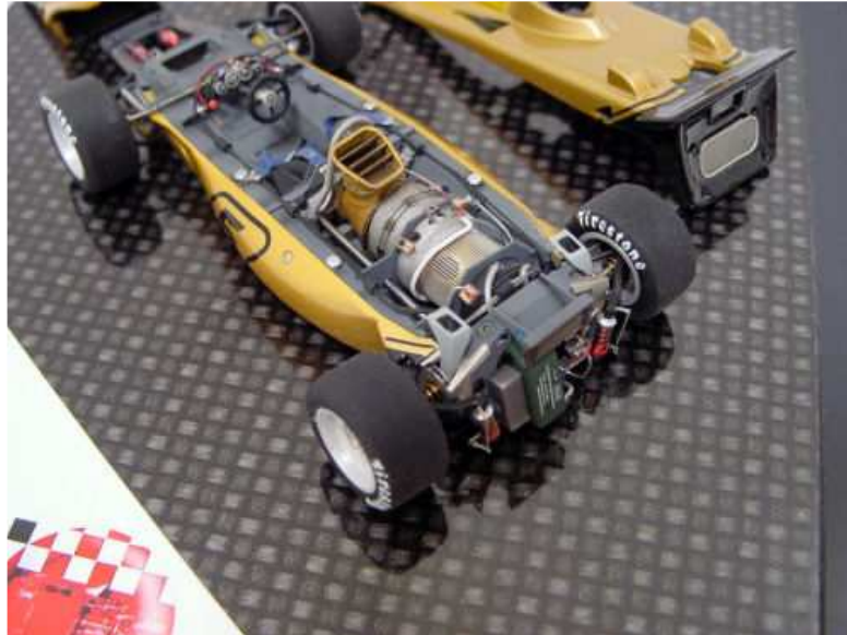
Miniwerks Tameo 56B