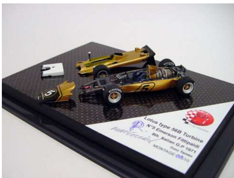
Miniwerks Tameo 56B

Miniwerks had a limited run of 10 Tameo Lotus 56B models made by Built Up Models (France). Very high quality and price.... Remember this is 1/43 rd scale! Here are two images: