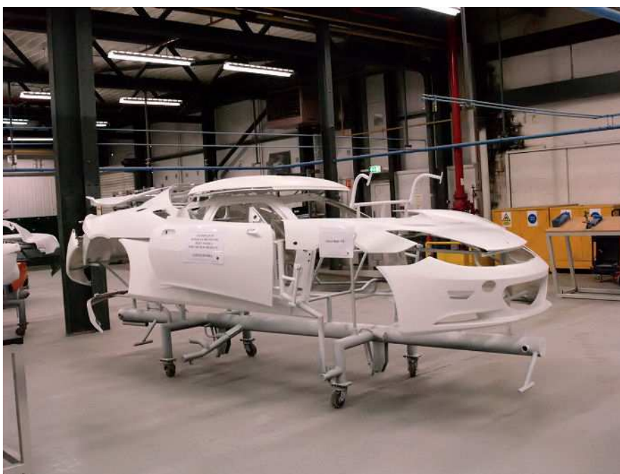
The parts that have to be painted...