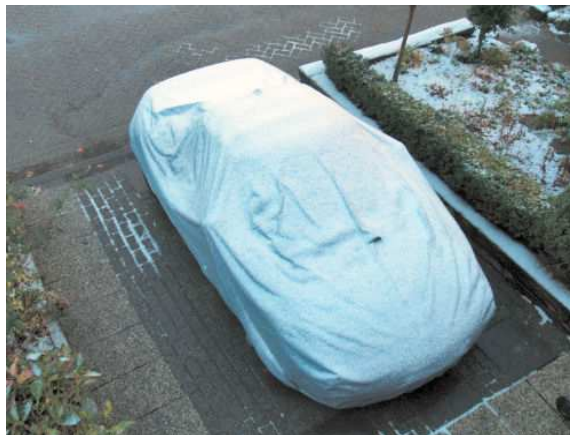
My Elan sleeping in the first snow