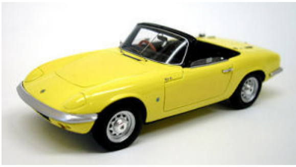
Announced by Ebbro ; Lotus Elan S2 DHC , scale 1/43, made from resin