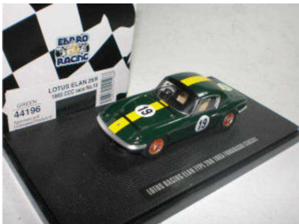
Elan 26R 1965 CCC Race by Ebbro , 1-43, resin