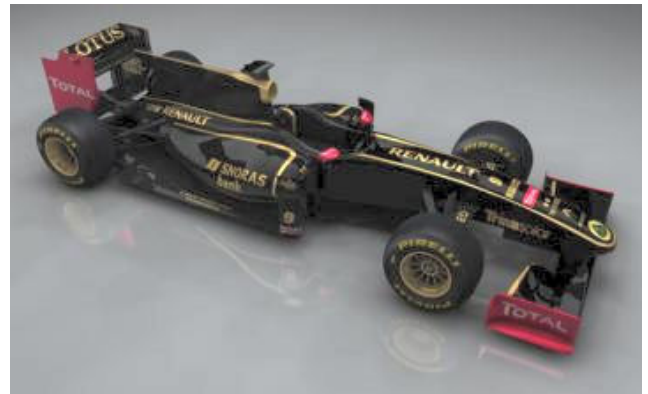
Lotus Renault GP in 2011