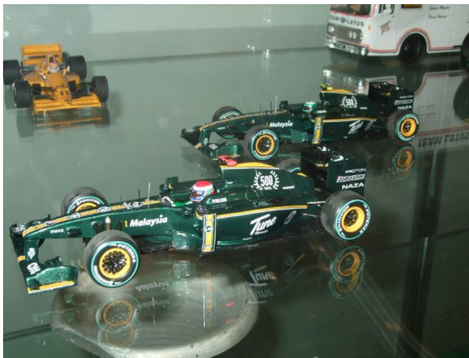
The Lotus Racing T127 by Spark looks ready for delivery, scale 1:43