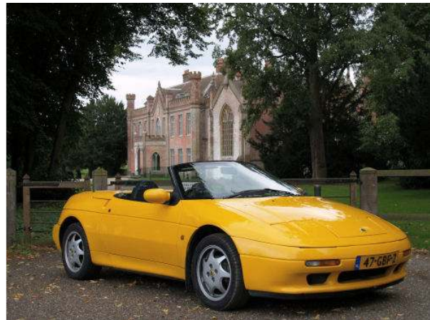
Visiting Ketteringham Hall