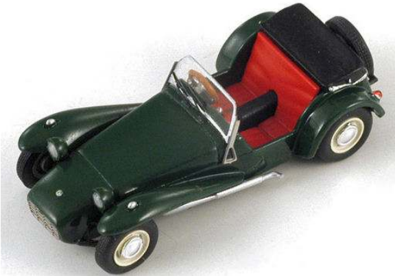
Seven S2 by Spark, 1/87 th

And I believe I did not yet show you their 1960 Seven S2 , also 1/87 th