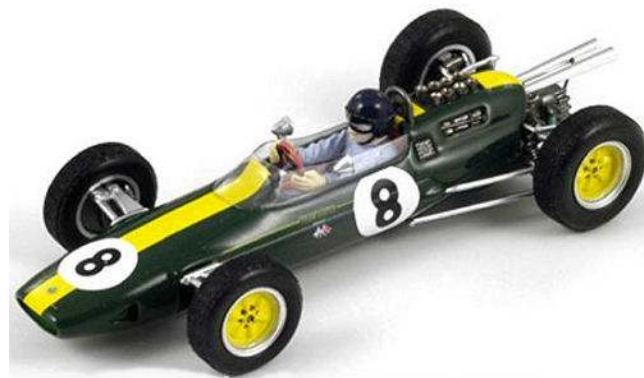
Lotus Type 25 by Spark, 1/43 rd

Again a new model made by Spark , this time it is the 1/43 rd Lotus Type 25 , #8 winner GP Italy 1963, Jim Clark (World Champion)