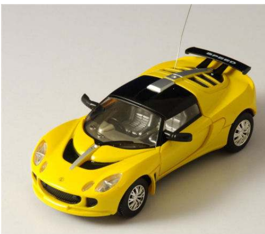
Exige 1/32 nd Remote Control

Here is an interesting new toy: a remote controlled Lotus Exige in 1/32 nd scale! It is a plastic model car that can move forward, left, right and reverse. Only 103 millimetres long! Made in Hong Kong as far as I know, the name of the manufacturer is not yet clear.