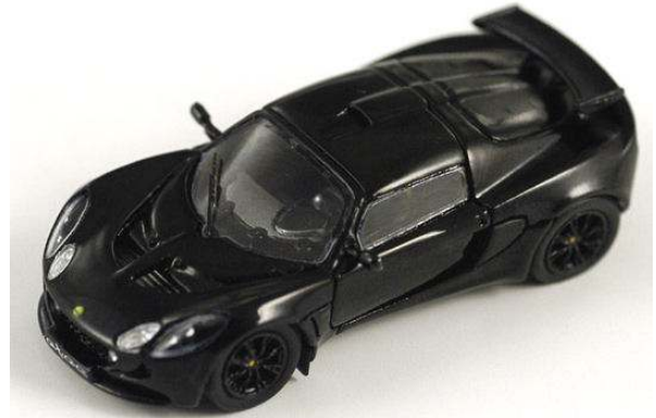
Exige 1/87 th by Spark

Spark presented their new Exige in 1/87 th scale in April, here is an image for you: