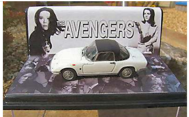
Elan Emma Peel, Vitesse code 3

In issue 17 of this newsletter I did write about a Vitesse 1/43 rd 'Emma Peel Elan '. As far as I know now, this is a code 3 model, a standard model that was altered by a third party after it had left the factory. And here is another one, not as nice as the first Emma Peel model that I did show you and also a code 3 model. I haven't got a clue how many of this version are made. There have not been as many changes to the standard model as there are on the other model (issue 17) but it does have the correct number plates.