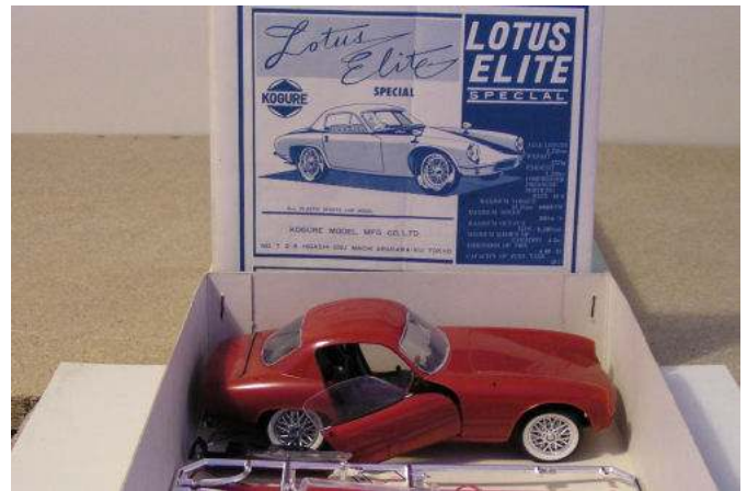
Elite 1/20 th kit by Kogura