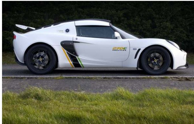
Exige 270E Tri-Fuel

Group Lotus plc unveiled the first glimpse of the eagerly awaited Project Eagle at the 78th annual Geneva International Motor Show.