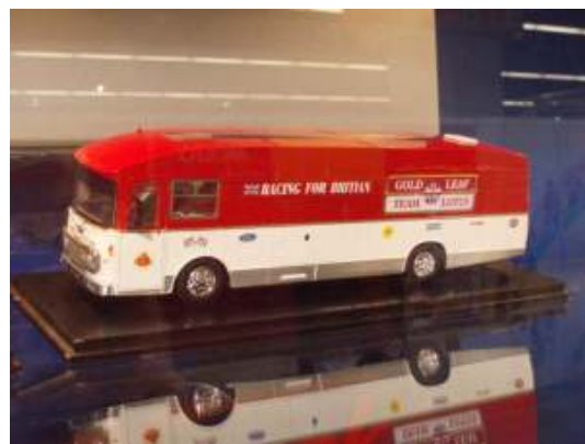
Team Lotus Transporter

And another image, the Proton Elise in red, as announced by Spark in 1/43 scale. Here are the 1/1 model and the scale model: