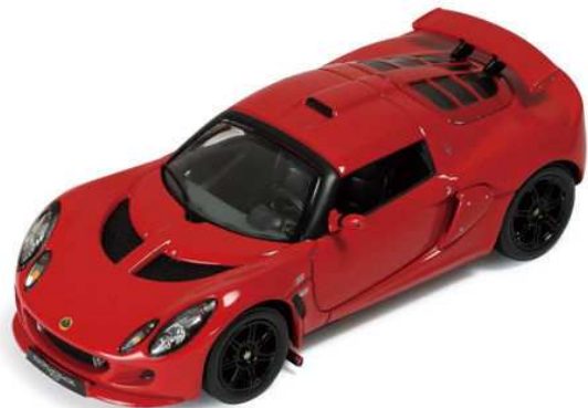
Exige S 2006 by Ixo, 1/43 rd

These models should be available in the specialist shops by now.