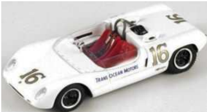
Spark 1/43 rd Type 23 Lotus-Porsche

Follmer then decided to compete in the top-level 1965 USRRC. Follmer was leading the championship. In early 1966, Follmer sold the Lotus 23-Porsche. In the late 1980s, it reappeared in an as-raced and much-modified condition. Eventually purchased by a collector in Germany, it was restored with advice from its original mechanic Bruce Burness.