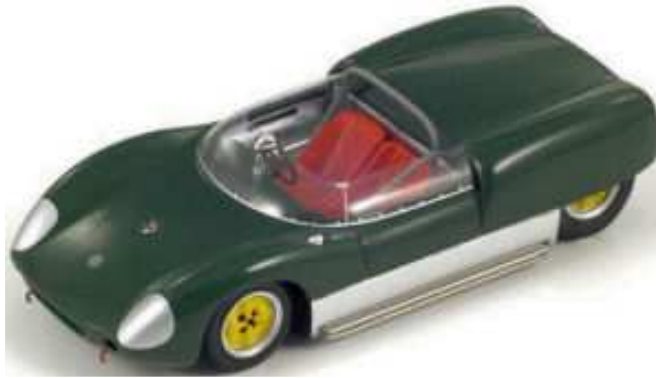
Spark 1/43 rd Type 19

An other new Spark model is this 1/43 rd Type 19 (1960) 'street version':