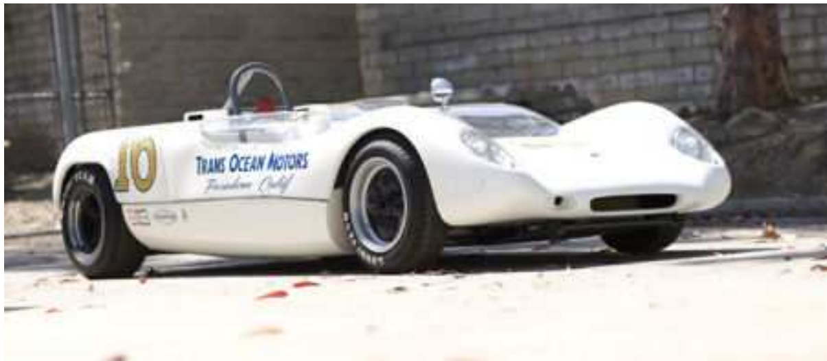
Original Type 23 Lotus-Porsche

Spark has recently released some new 1/43 rd models. One of these is the Lotus-Porsche that was raced by George Follmer. This racing car driver was successful in Southern California sports car racing with Porsches in the early 1960s. At one point he was looking for a competitive sports-racer in the under-2 liter class and ordered a new Lotus 23 without engine or radiators. Follmer and mechanic Bruce Burness upgraded the Lotus to full 23B specifications and beyond to accommodate a Porsche 904 engine.