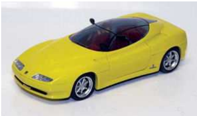
Alezan Pininfarina Chronos

Future 1/43 rd releases that are expected in 2009 from Spark : 1967 Lotus 47 LeMans , 1969 Lotus 62 Groupe 6 prototype , Lotus 25 #8 Win. Italy GP '63 and 1/87 th releases expected are 1960 Lotus Seven S2 , 1964 Lotus Elan S2