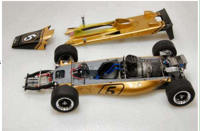
Type 56 by Model Factory Hiro

From Model Factory Hiro I did recently see this very detailed Type 56 1/20 multimedia kit.