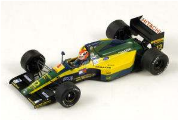
102D by Spark, 1/43

Spark showed their new version of the Type 102D in scale 1/43, this time it is the car used by Johnny Herbert (#12) during the South African GP 1992, where he ended the race on the 6 th position.