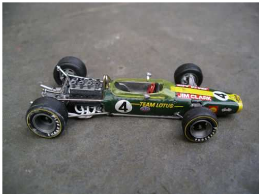
49 Meri 1-43