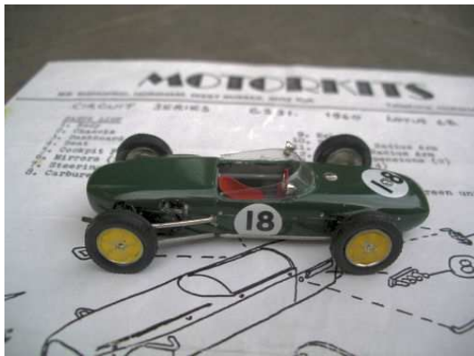
18 Circuit Series 1-43