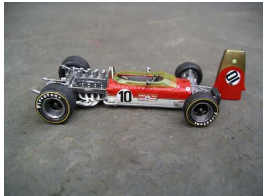
49 Meri 1-43