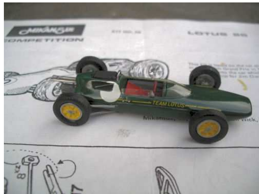
25 Mikansue 1-43