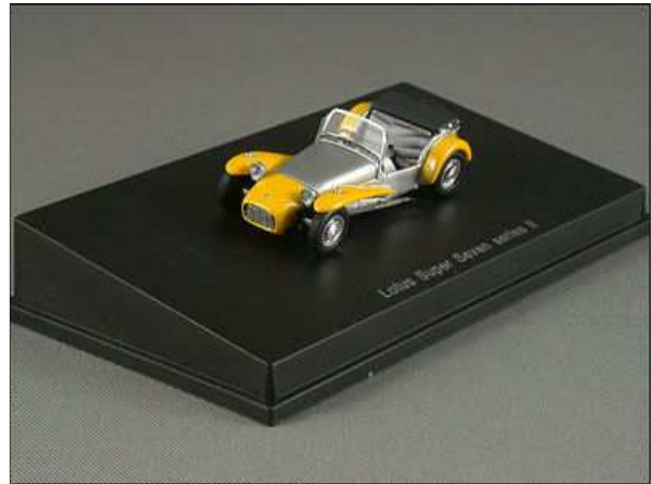
Seven S2 by Spark, 1/87

New from Scalextric is this Graham Hill version of their 1/32 Lotus Type 49 :