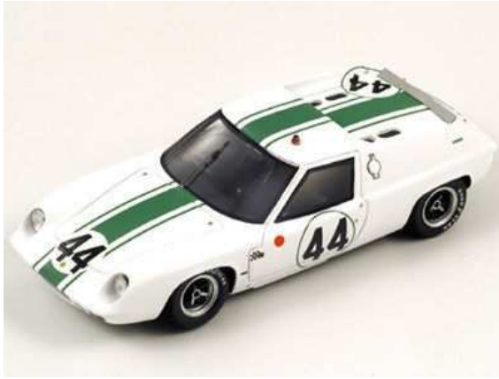
Type 47 by Spark, 1/43