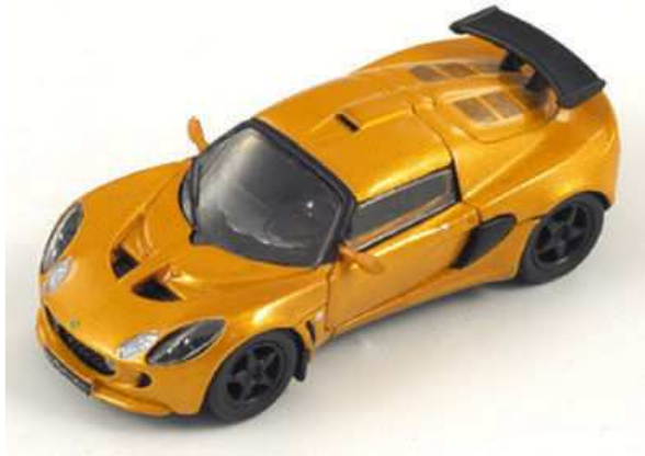
Exige S2 by Spark, 1/87