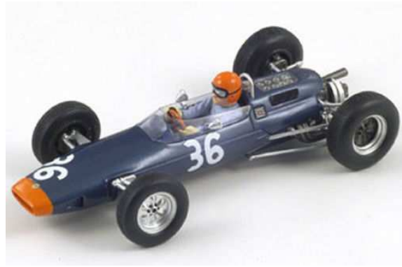
Type 25 BRM by Spark, 1/43