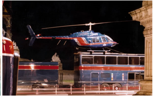
On the move....