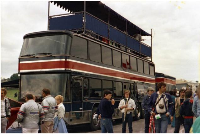
Brands Hatch 1980

From one of the readers of this newsletter I did receive these images of Essex Team Lotus' means of transport.