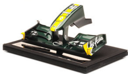
Team Lotus T128 Nosecone - 2011 H. Kovalainen 1:12

Amalgam makes the largest diecast models money can buy, with its 1:8 replicas covering Formula One, supercar and endurance racing subjects. It is also unique in offering 1:4 steering wheels and 1:12 nose cone models of the leading F1 teams. Here are some of the latest nose cones: