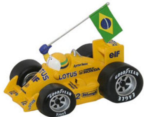
1987 – Type 99T