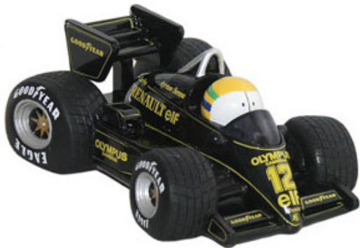
1985 – Type 97T