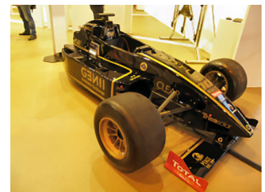
Driving simulator at the carshow in Paris. "I found a Lotus!"