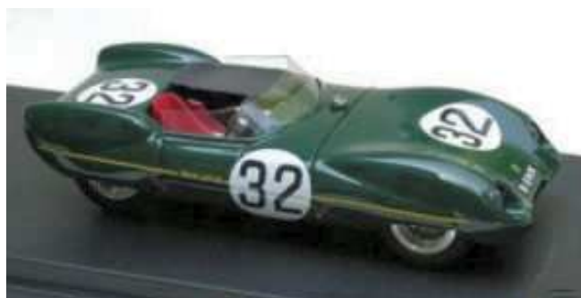
Lotus Mark XI, 1956 Le Mans Chapman, by Pinko, 1/43