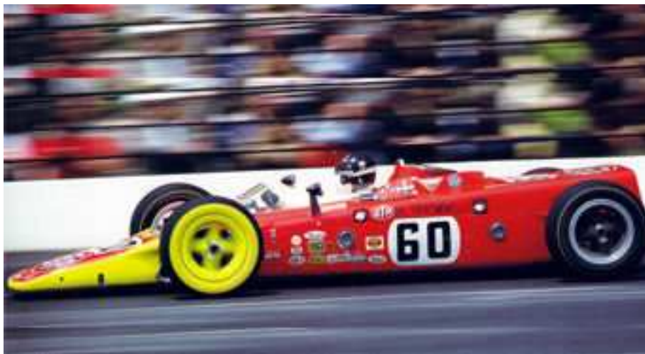
Tameo Type 56, 1/43 rd

Tameo have announced a new version of the 1/43 rd Type 56; the Lotus Type 56 Turbine Indy 500 1968, Driver Joe Leonard. This model will be available by October 2008.