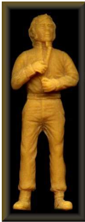
Jackie Stewart 1/43rd