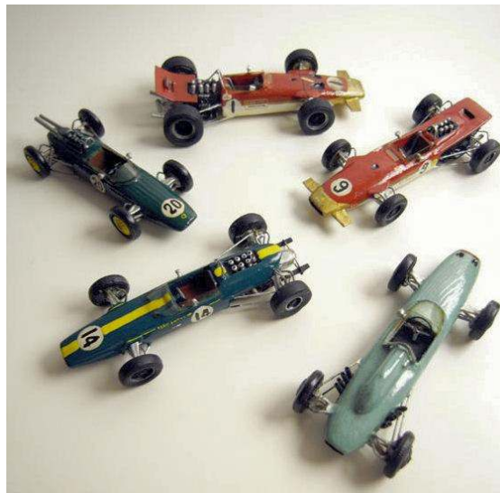
Two 49s, a 25, a 33 and a 24 by RD Marmande, 1/43