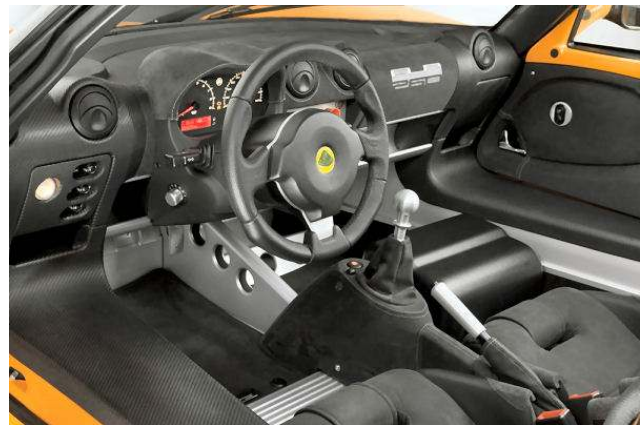
Exige Cup 260 interior