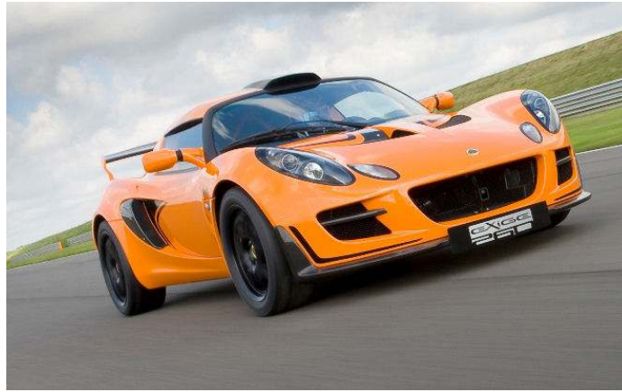
Exige Cup 260 MY 2010