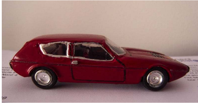
Lotus Elite by RD Marmande, 1/43

Raymond Daffour is believed to have made between 18.000 and 20.000 models, mostly 1/43 scale but there are supposed to be some models in 1/24 and 1/14 scale as well.