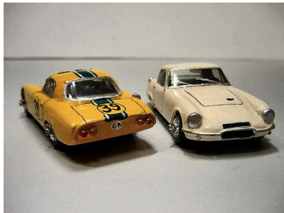
A pair of Elites, RD Marmande, 1/43

These models are made between 1957 and 1977. Next to the Sapin Wood he used materials like plastic and aluminium foils and also existing components like wheels from Norev and Solido.